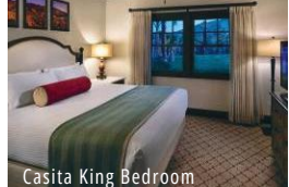
Casita King Bedroom

The Inn's recent multimillion-dollar restoration has brought new life and energy to the historic property. What's more, you can now enjoy this true American oasis while staying in one of 22 new casitas situated around the famed gardens. Located in the shadow of the Oasis Gardens' date palms, the Inn's casitas offer unparalleled privacy and luxury within easy walking distance of the Inn pool. Each spacious Casita is over 500 square feet and comes with a complimentary golf cart for guests to use to get around the property (cars cannot get down to these rooms) as well as room options with either one king bed or two queen beds. In addition to the main sleeping quarters, each casita also has a living room with a sleeper sofa as well as a wet bar – perfect for fixing your cocktail while you hear the wind rustle through the palms overhead.