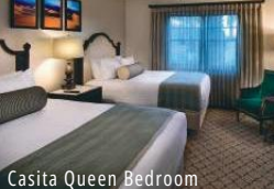
Casita Queen Bedroom