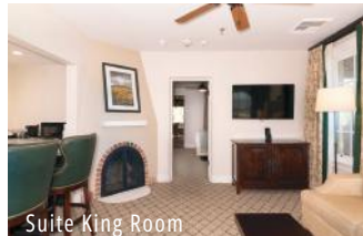
Suite King Room