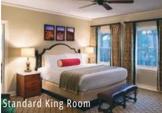
Standard King Room