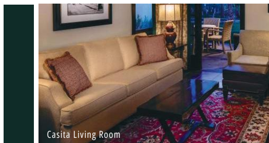
Casita Living Room