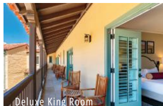
Deluxe King Room