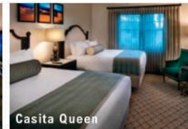
Casita Queen Bedroom