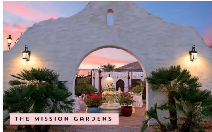
THE MISSION GARDENS

The Stargazer Terrace features a 270-degree view of the Oasis Gardens and the desert beyond. Ideal for sunsets and taking in Death Valley's internationally famous night skies, this locale is the perfect spot for smaller, more intimate gatherings.