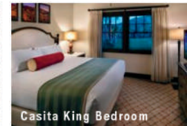
Casita King Bedroom

The Inn's recent multimillion-dollar restoration has brought new life and energy to the historic property. What's more, you can now enjoy this true American oasis while staying in one of 22 new casitas situated around the famed gardens. Located in the shadow of the Oasis Gardens' date palms, the Inn's casitas offer unparalleled privacy and luxury within easy walking distance of the Inn pool. Each spacious Casita is over 500 square feet and comes with a complimentary golf cart for guests to use to get around the property (cars cannot get down to these rooms) as well as room options with either one king bed or two queen beds. In addition to the main sleeping quarters, each casita also has a living room with a sleeper sofa as well as a wet bar – perfect for fixing your cocktail while you hear the wind rustle through the palms overhead.