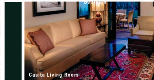
Casita Living Room